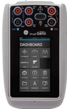
DPI620G Multifunction Calibrator and Communicator