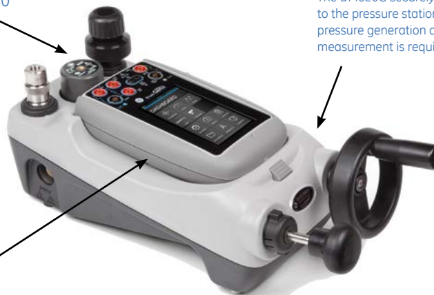
PV62XG Pressure Station. The DPI620G securely attaches to the pressure stations when pressure generation and measurement is required