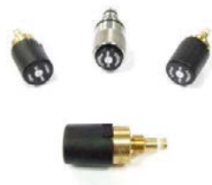
Relief Valve Table